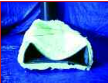
12"x36" rectangular, 16 Ga., welded, carbon steel duct with generic "wrap" insulation – after 2000°F (simulated grease fire) for 30 minutes.